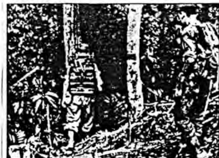
1950. The Malayan Emergency.

It was the Labour Party which re-introduced British imperialism's police-military dictatorship to occupied Ireland, with its death-squads concentration camps, & torture barracks to back the Orange-fascist colonists.