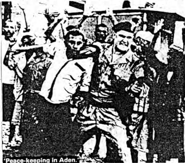
'Peace-keeping in Aden.'

The relentless conditions of deepening capitalist slump & war-mongering will provide the basis for replacing that by a resurgent Leninist movement. Widespread illusions in Labour is now an almost dead, or dying, phenomenon. The ILWP is proving that what the Bolsheviks achieved from small beginnings in Russia can be repeated, or even improved upon, in Britain & the West in general. Spread the ILWP Bulletin. Build Leninism. Bulletin 405 (5/8/87) and 406 (12/8/87)