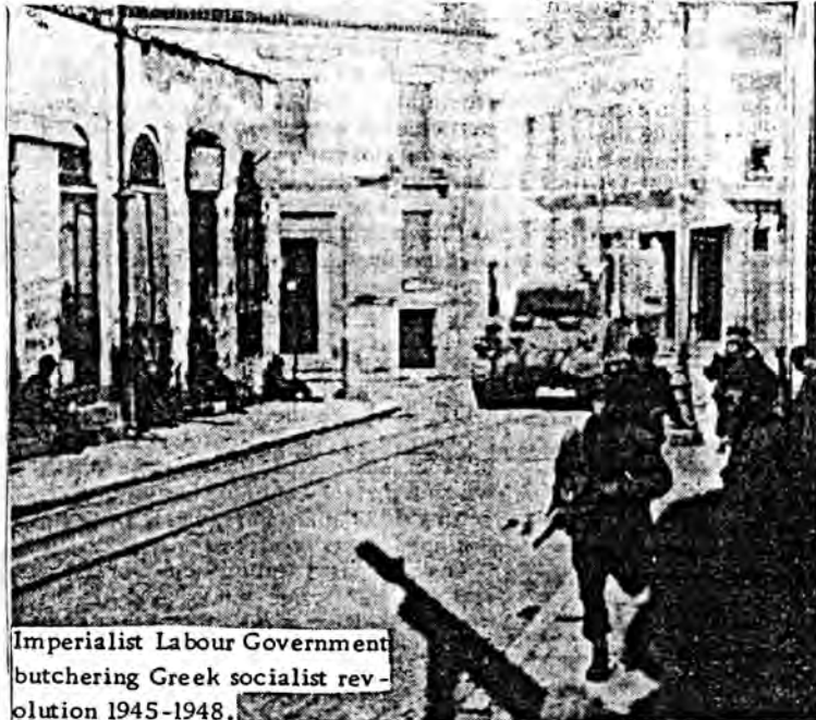
Imperialist Labour Government butchering Greek socialist revolution 1945-1948.

ILWP Bulletin 10p (Weekly newspaper of the International Leninist Workers Party)