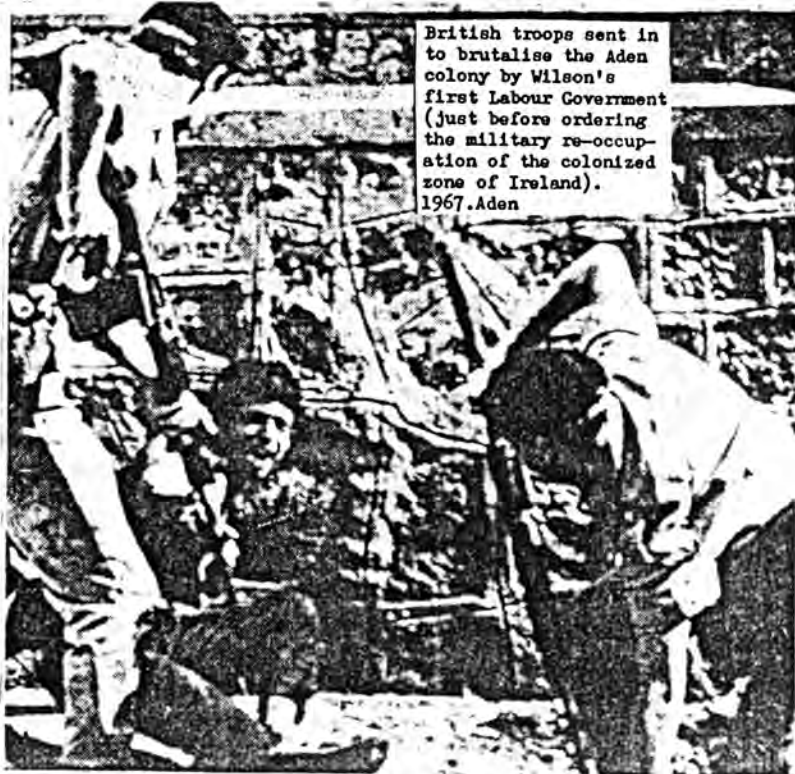
British troops sent in to brutalise the Aden colony by Wilson's first Labour Government (just before ordering the military re-occupation of the colonized zone of Ireland). 1967. Aden

Reformist 'socialism' is finished. Down with 'labour movement traditions'. For class war against anti-communism & against collaboration with imperialism. Proletarian dictatorship is the only worthwhile democracy.