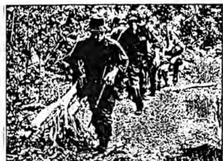
1966. The Borneo Confrontation.